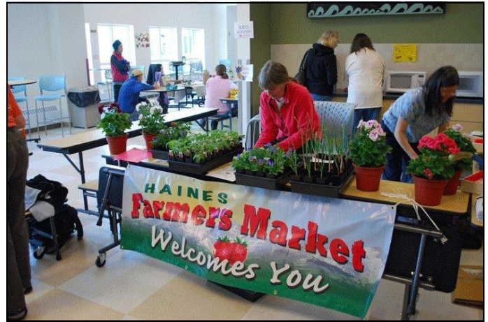
Tending the Flowers