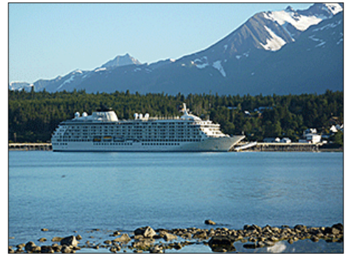
The World docked in Haines.