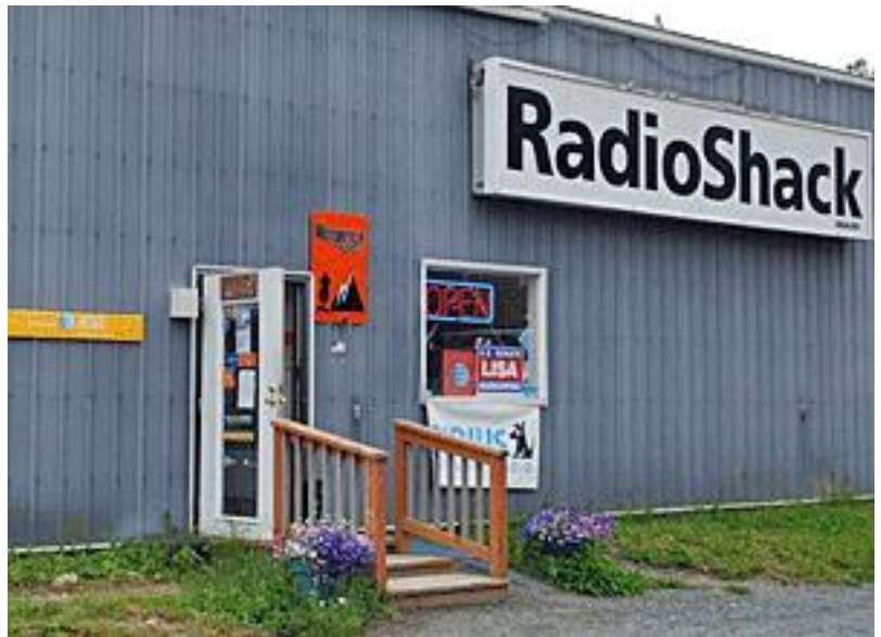
Radio Shack, Etc.

When it comes to multi-tasking business, that is, having multiple operations in a small town environment to make ends meet, Patty Campbell is the classic case. A glance at her store front on Main Street tells part of the story. There are signs within and without for Radio Shack, AT&T Cellular,