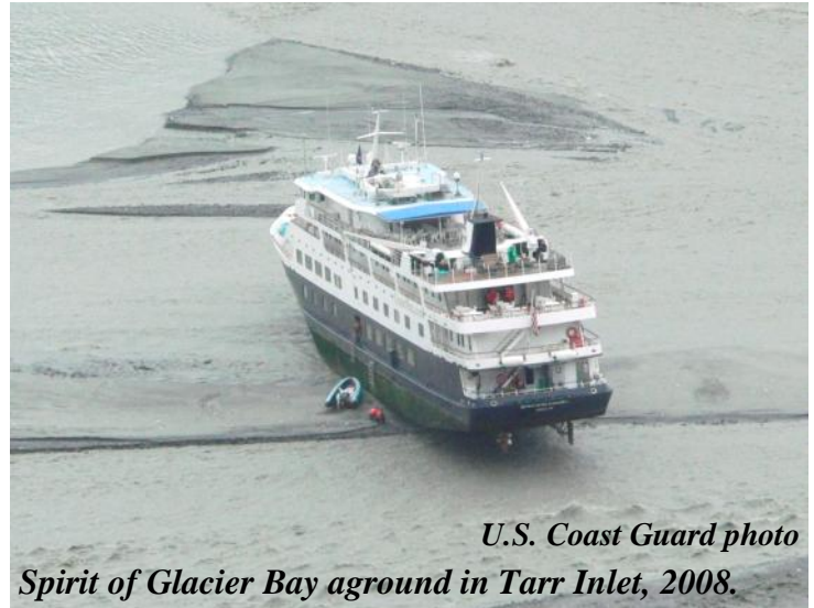
Spirit of Glacier Bay aground in Tarr Inlet, 2008.